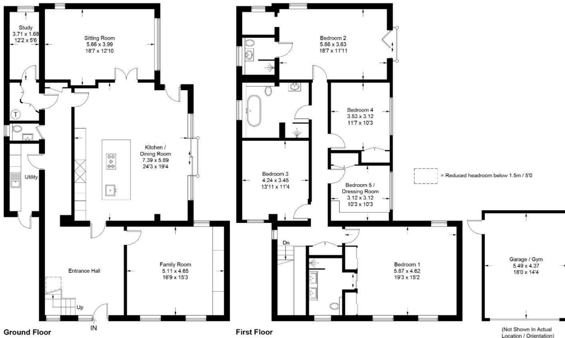
Illustration for identification purposes only, measurements are approximate, not to scale. floorplansUsketch.com © (ID801720)